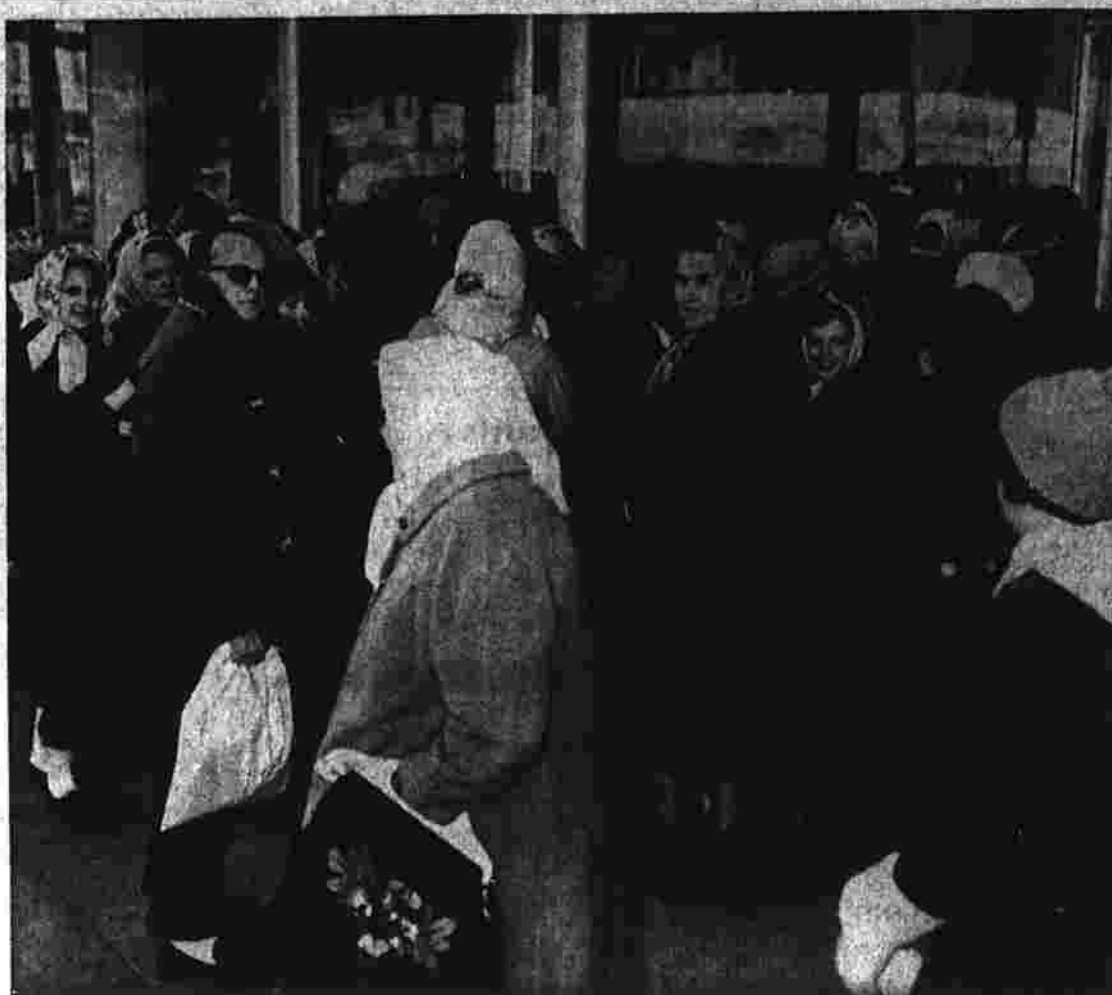
This is an early morning scene yesterday in downtown Manchester as predominantly women shoppers lined up in front of stores with hand bags and pocket books to get first chance at the Washington Day Birthday bargains...