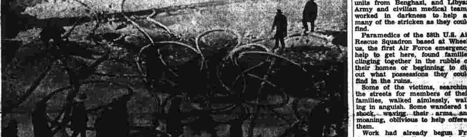
Work had already begun Friday morning to dig graves for the dead south of the city, which is bordered by flooded fields and wading their arms and moaning, obvious to help offered them.

250 Dead, 500 Hurt, In Al Marj. AL MARJ, Libya (AP)—Dawn broke Friday to reveal the full horror of the earthquake which struck this Eastern Libyan city of 11,000 Thursday night.