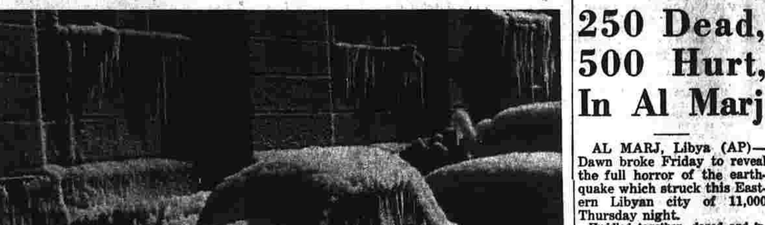
In the aftermath of yesterday's fire cars along Ann St. were thickly coated with ice and frozen to the ground.

250 Dead, 500 Hurt, In Al Marj. AL MARJ, Libya (AP)—Dawn broke Friday to reveal the full horror of the earthquake which struck this Eastern Libyan city of 11,000 Thursday night.