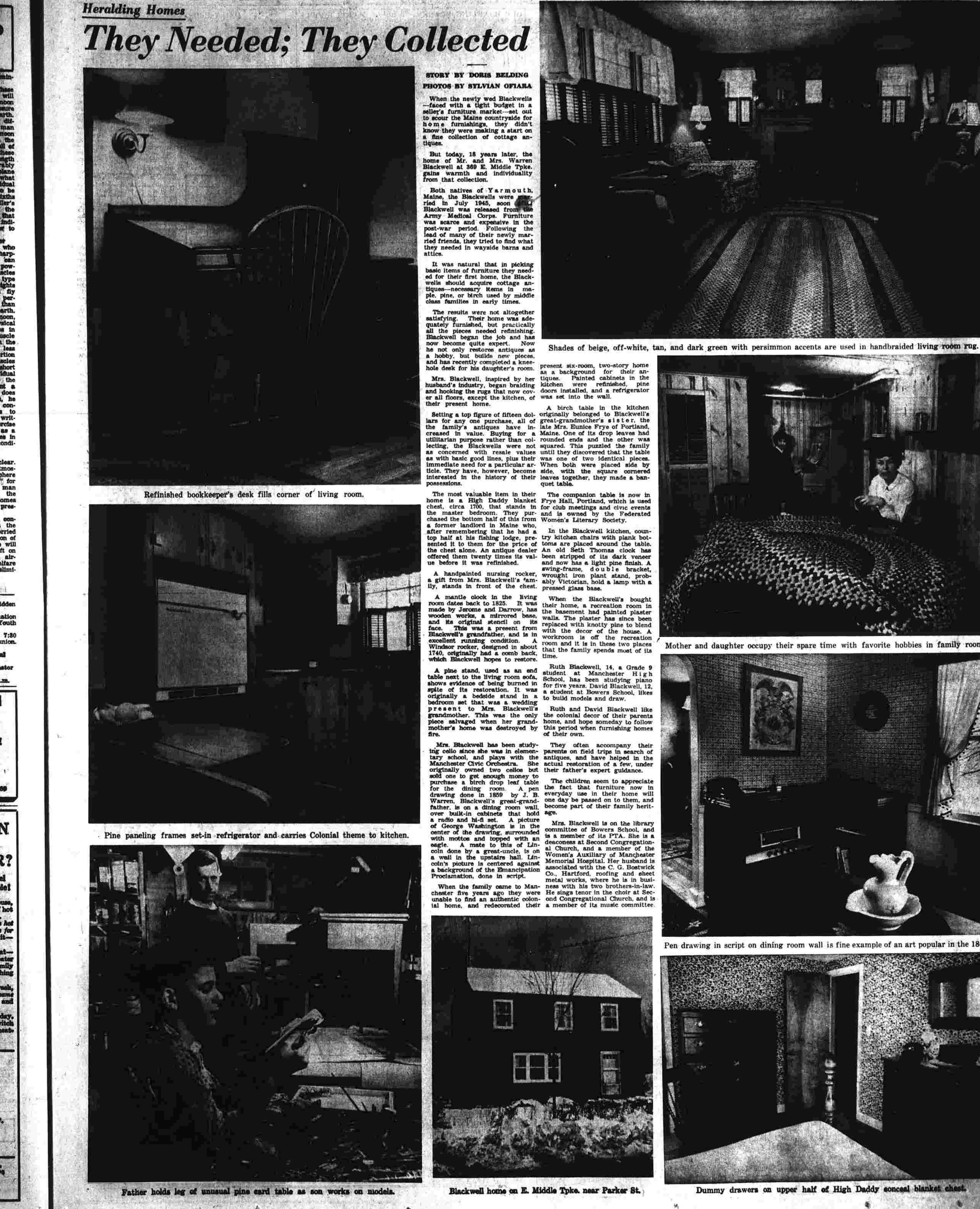
23 Shades of beige, off-white, tan, and dark green with perisperm accents are used in handraided living room rug. Mother and daughter occupy their spare time with favorite hobbies in family room. Pine paneling frames set-in refrigerator and carries Colonial theme to kitchen. Father holds leg of unusual pine card table as son works on model. Blackwell home on E. Middle Tpk. near Parker St. Dummy drawers on upper half of High Daddy conceal blanket chest.

Blackwell home on E. Middle Tpk. near Parker St. Dummy drawers on upper half of High Daddy conceal blanket chest.